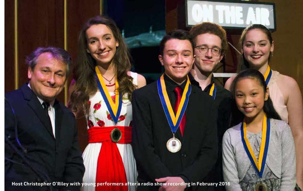
Host Christopher O'Riley with young performers after a radio show recording in February 2016