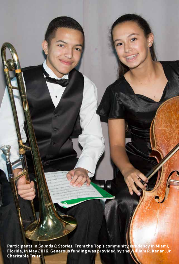
Participants in Sounds & Stories , From the Top's community residency in Miami, Florida, in May 2016. Generous funding was provided by the William R. Kenan, Jr. Charitable Trust.