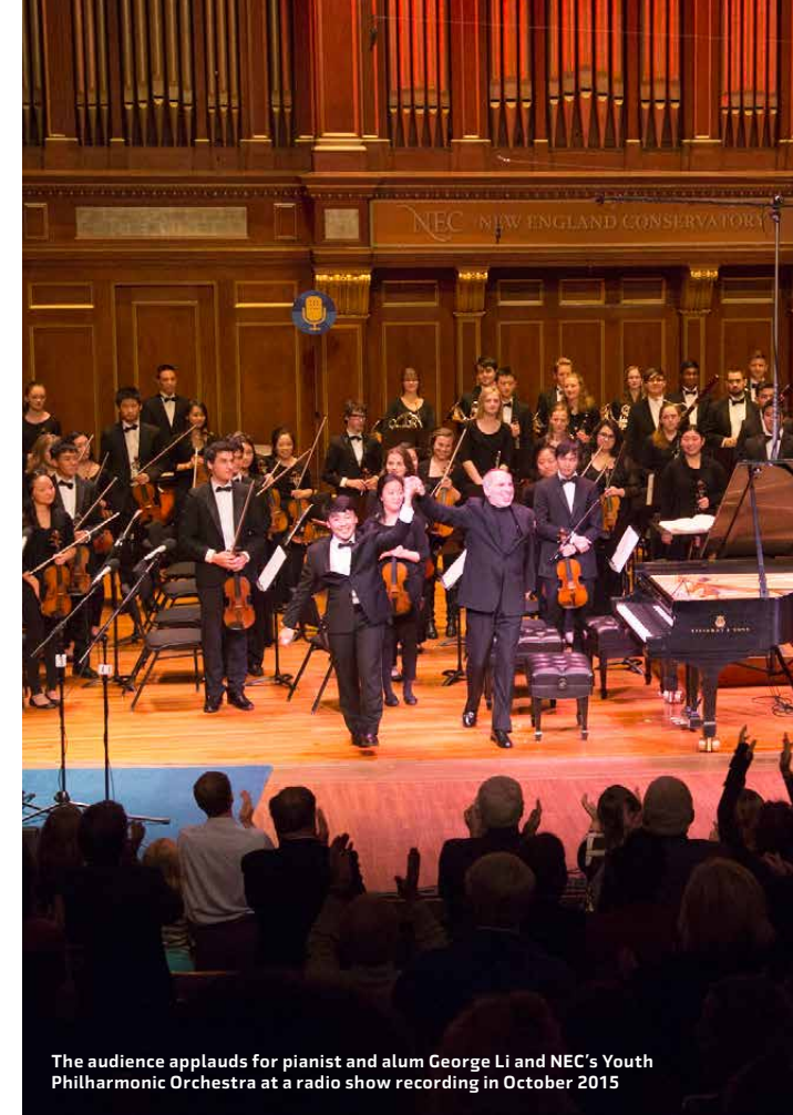
The audience applauds for pianist and alum George Li and NEC's Youth Philharmonic Orchestra at a radio show recording in October 2015