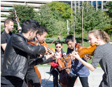
TIME FOR THREE: Classical superstars Time for Three decide to do a little busking on Boston’s Greenway, but encounter three young From the Top alums with different plans.