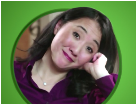
MOM’S TIPS: In this series of video shorts, music moms and dads are offered survival tips.