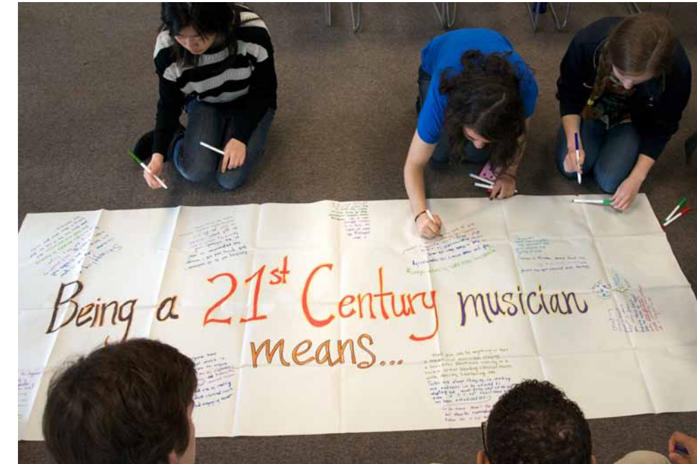
From the Top performers explore leadership pathways at their arts leadership orientation

In 2013–14, From the Top received significant grants from the William R. Kenan, Jr. Charitable Trust, the Howard and Geraldine Polinger Family Foundation, and the Free for All Concert Fund, to support expanded outreach programming in six locations: